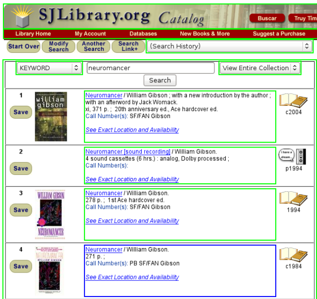
Figure 3: Output of our clipping algorithm on a library website. Each green region represents a clip; the blue region is the best clip relative to the command “search sjlibrary for book neuromancer”.

We formulate auto-clipping as a search problem. We assume that the most relevant response will be a portion of the last web page reached after script execution. For all possible regions on this page, which region is most representative of the “result” of the script execution? We use the user’s command text as a clue.